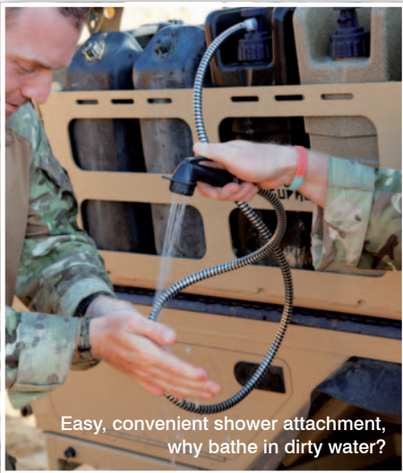
Easy, convenient shower attachment, why bathe in dirty water?